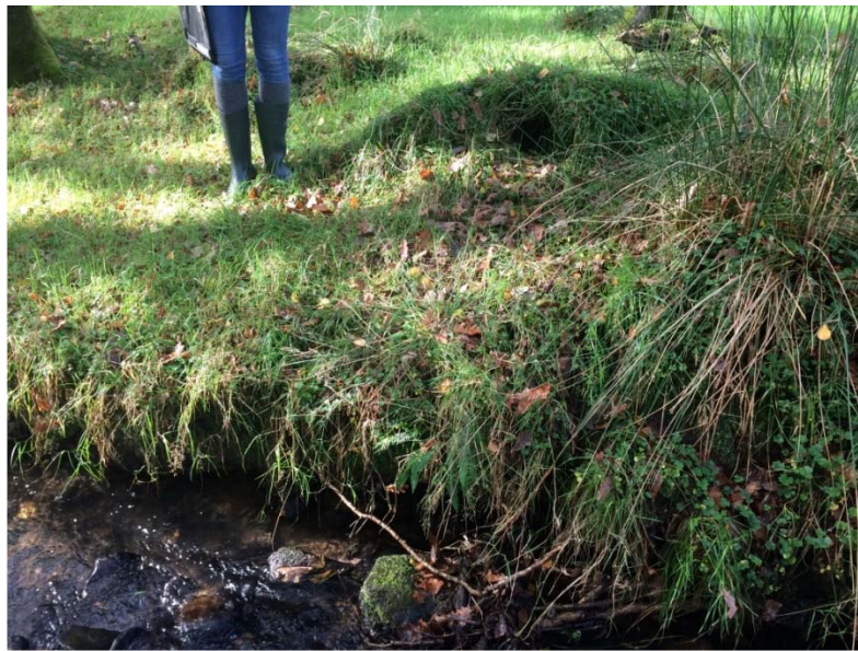
Plate 1.1: Photographs of couch-type hole (Feature 1)