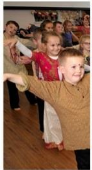
Children from year two at Brynhydydd infants performing Indian dancing for their parents the pupil have been learning about the Festival of Light.

They also celebrate one of the Diwali legends, which tells of the return of Rama and Sita to Rama's kingdom after fourteen years of exile.