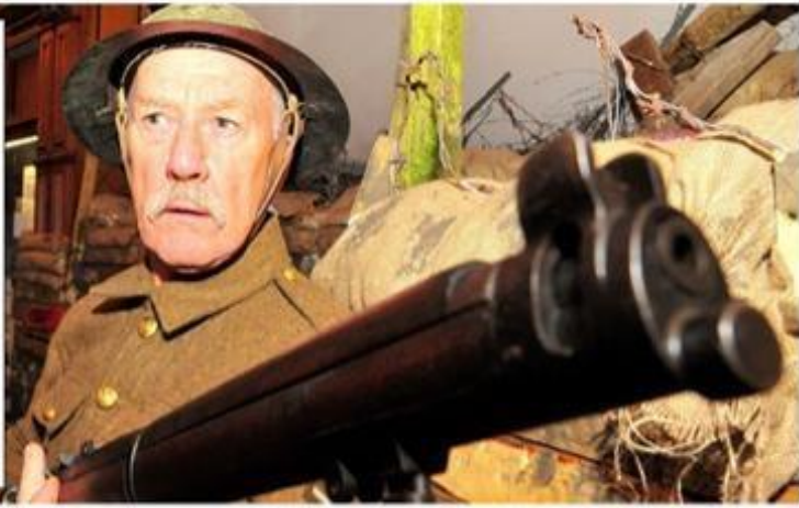
SWANSEA 14 TO 15A-033, C