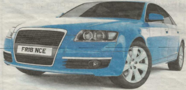
World cup-themed number plates from the DVLA include the ones pictured here.

surrounding this incident. "Anyone who saw this vehicle or a woman walking on roads around the Llandello area is urged to call Carmarthenshire RPU on 101, quoting reference DP-20180129-279." The woman, who is believed to have been aged in her late 50s to early 60s, has not yet been named by police.