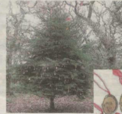
Left, the Friendship Tree in Pontardulais which was wrecked by vandals; below, the wooden messages.

"I made 25 tags in the beginning and it has gone from there."