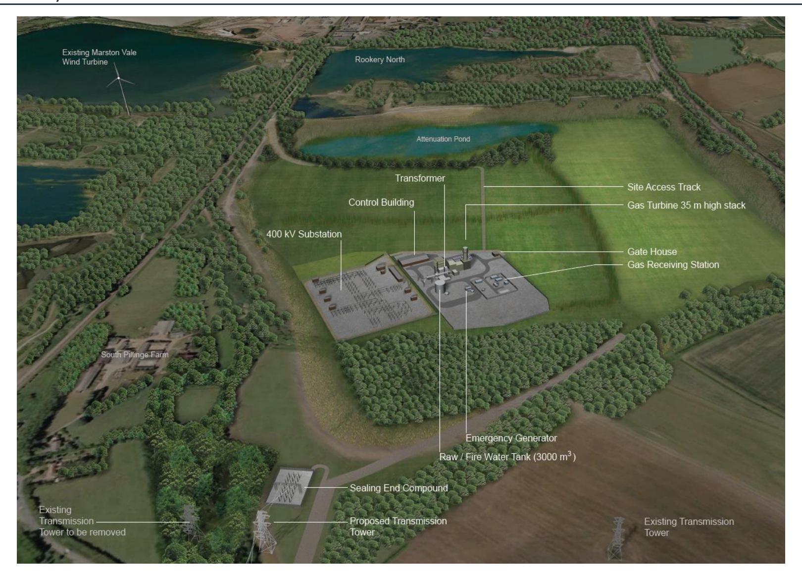
Insert 2 – Indicative 3D Visualisation of Project Site