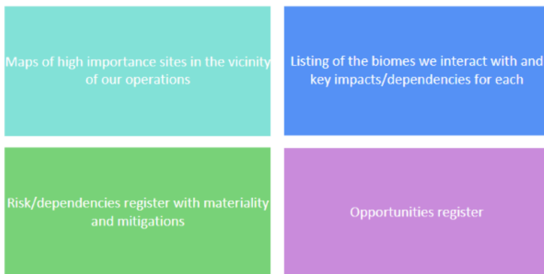
Figure 2. Drax Nature Assessment Four-Box Approach